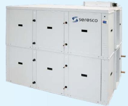
NE 200 Series

Carefully designed to fit through doorways as narrow as 30 inches.