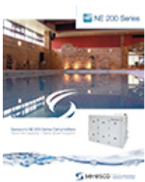
Seresco NE 200 Series Dehumidifier